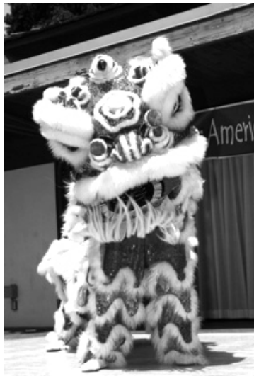
Shaolin Cultural Center performs a Chinese Lion Dance