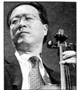
Yo-Yo Ma: Chinese still suffer from stereotyping.